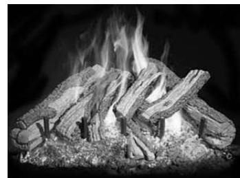
Western Campfire (WCF Series) Sizes 18", 24", 30"