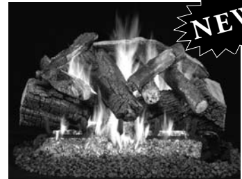
Charred Majestic Oak (CHMJ Series) Sizes 24", 30", 36"