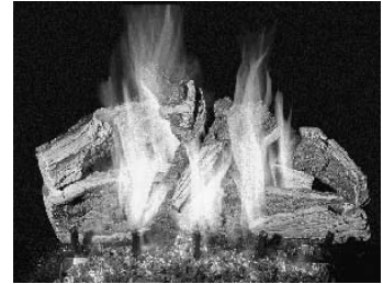
Charred Rugged Split Oak (CHRRSO Series) Sizes 18/20", 24", 30"