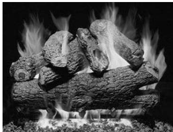
Royal English Designer Oak (BD Series) Sizes 18", 24", 30", 36", 42"