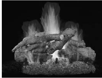
Charred American Oak (CHAO Series) Sizes 18/20", 24", 30"