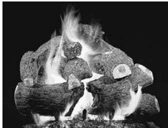
Charred Royal Oak (CHB Series) Sizes 18/20", 24", 30", 36", 42"