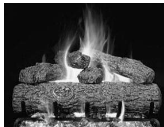
Golden Oak (R Series) Sizes 18", 24", 30"