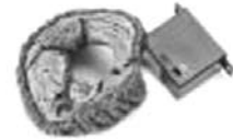
Model # WCDC-1