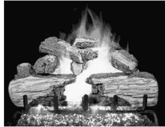
Charred Split Oak (CHS Series) Sizes 18/20", 24", 30", 36"