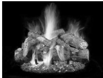
American Oak (AO Series) Sizes 18", 24", 30"