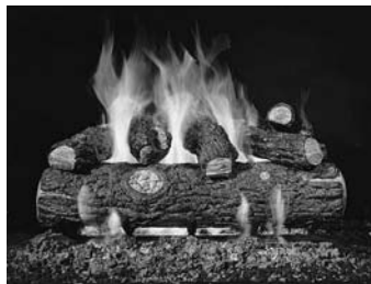
Golden Oak Designer Plus (RDP Series) 12", 16", 20", 24", 30", 36", 42", 48", 60"