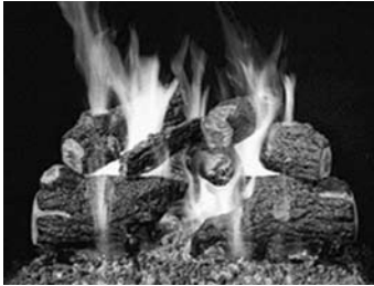
Charred Oak (CHD Series) Sizes 16", 18/20", 24", 30"