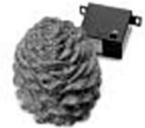
Model # PCDC-1