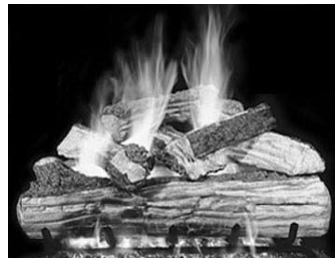
Split Oak Designer Plus (SDP Series) Sizes 20", 24", 30", 36"