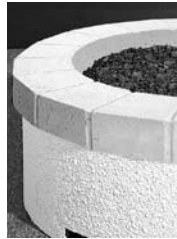
Plain Concrete (OCR-34-PC)