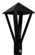
Gas Light Head